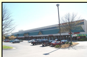
FRONT VIEW Shows Well!

91,910 s.f. Center. THREE levels! Built 1990. New roof in 2008. At Allentown Rd & Rt 5, one traffic light from Rt. 495. Second floor—Two Stories High! Ground level entrance, approx. 41,400 s.f. available for lease. Third Floor approx. 12,260 s.f.. Future expansion of third floor (approx 7,716 s.f.) would be perfect for choir loft! Third floor office space (4,450 s.f.) for lease. Long term tenants in place! CLICK FOR MORE INFORMATION