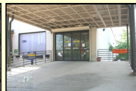
2ND FLR-Covered Ground Entryway