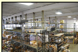
2ND FLR-41,400 S.F. Vacant Now!