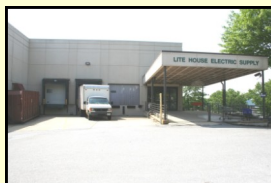
2ND FLR-Loading Docks and Entrance